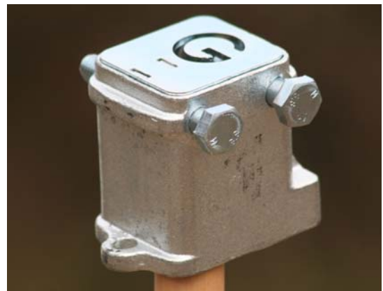
The Bak-Rak Casting and Clam Shell @ £19 + VAT