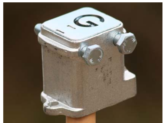
The Bak-Rak Casting and Clam Shell @ £19 + VAT