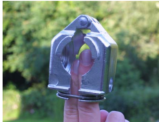
The unique Bak-Rak 'Clam Shell' which allows for all sorts of units to be easily installed