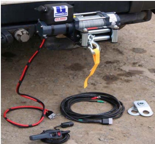
Bak-Rak mounted TDS ATV/GP4000 c/w vehicle harness & quick disconnect fittings. £299 + VAT

For instance, you could install a tow ball at the top of a ramp, driveway or slipway to winch up dead vehicles, caravans or boats on trailers.