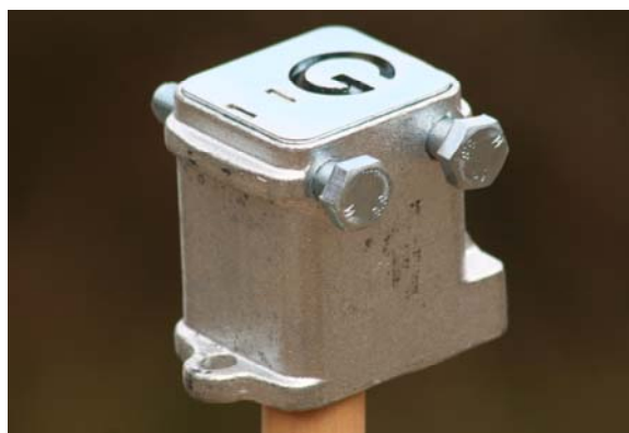
The Bak-Rak Casting and Clamshell @ £19 + VAT

As most of our business is UK and European 4x4 dealers and overseas sales, all prices are plus carriage and VAT.