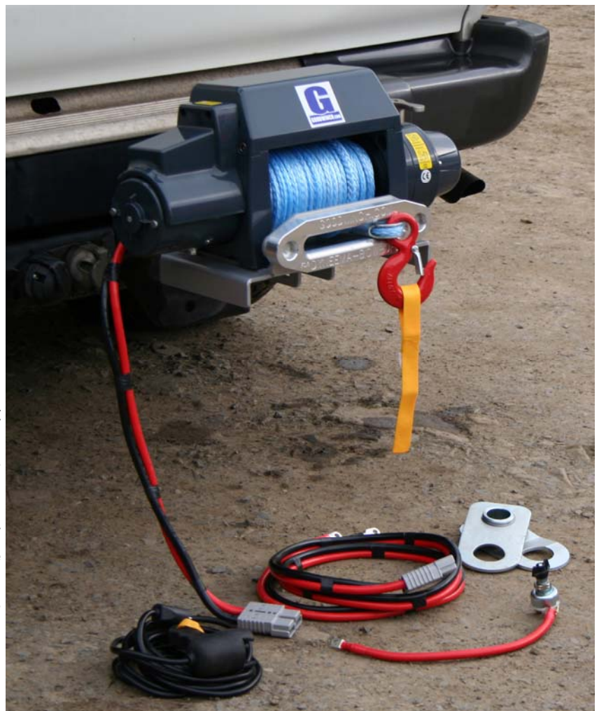
TDS-9.5i mounted on the largest of our portable Bak-Rak units with Dyneema® Bowrope, aluminium hawse and vehicle wiring harness with quick disconnect fittings @ £599 + VAT

Even a picnic or work table can be installed in a jiffy. In fact, the list is endless, there must be a limitless number of things you can hang on a tow ball, wherever it is fitted!