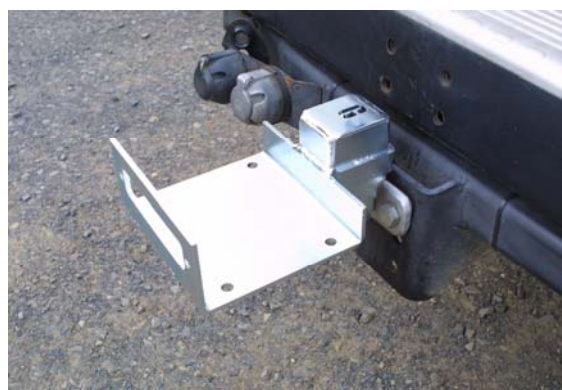
The medium sized version for 6" wide short drum winches up to 6,000lbs @ £59 + VAT