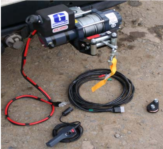
Bak-Rak mounted TDS ATV/GP3000 c/w vehicle harness & quick disconnect fittings. £279 + VAT