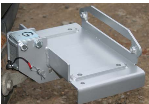
This larger version is designed for most 9,000lb winches @ £79 + VAT