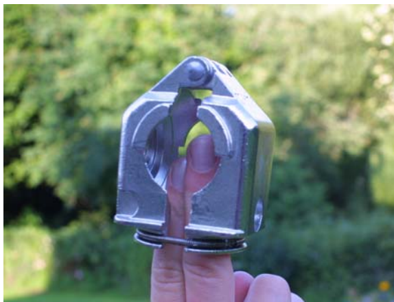
The unique bak-rak 'Clam Shell' which allows for all sorts of units to be easily installed

When the winch mount is installed, a ready made up for the vehicle wiring harness is supplied with quick disconnect fittings.