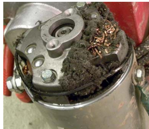
Although this shows an Iskra motor from a Husky winch, this is what can happen if you allow a winch to overspeed!

In a normal 'nominal' half-load off-road winching scenario, the BOWMOTOR armatures revolve at about 4,000 rpm, but at no-load with the gearbox in 'FREESPOOL' with a well sorted electrical system the armatures will turn at around 11,000 RPM, like a turbine!